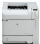
HP LaserJet P4014dn Printer